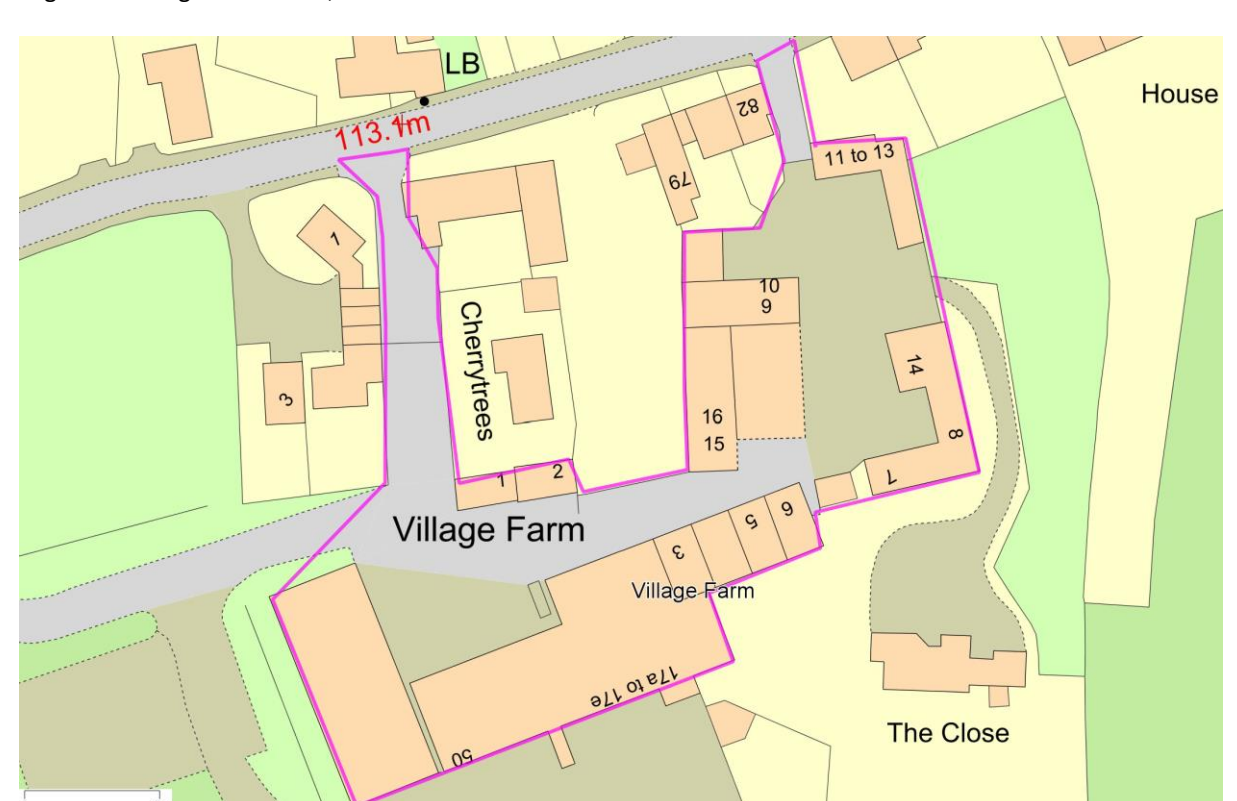
Figure 1: Village Farm Units, Preston